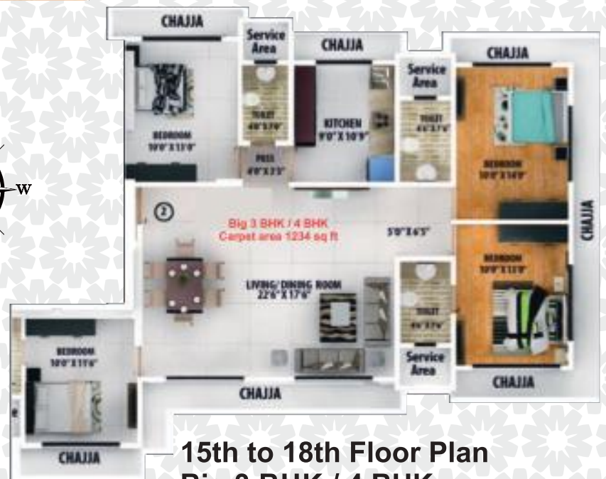
15th to 18th Floor Plan Big 3 BHK / 4 BHK Carpet Area 1234 sq.ft.