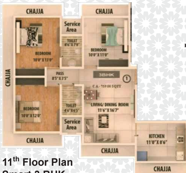
11 th Floor Plan Smart 3 BHK Carpet Area 759 sq.ft.